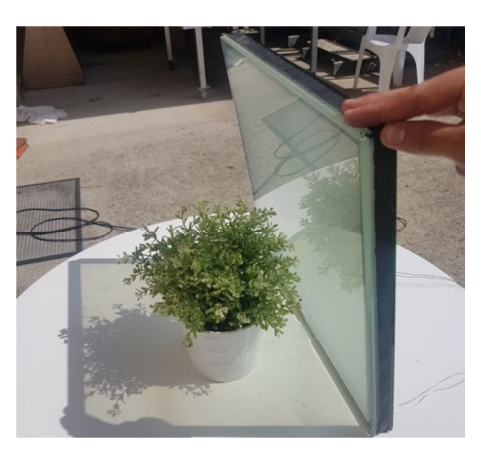
Switchglass ON 75% light passing through glass